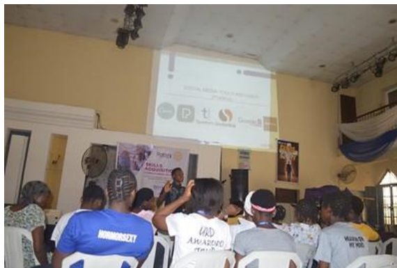
Participants being addressed by Program Instructor

The 2019 iteration of this program was held in February of the year in partnership with Ajoke Ayisat Afolabi Foundation ( AAAF ) and Rotary Club of Falomo District 9110. The edition was called Skills Acquisition Training for Girls ( SATT-G ). It was premised on the quest for equipping young girls with transformational critical thinking and problem solving skills. The first objective of the training included equipping young girls with practical skills such as cushion making, cushion covers and stools that could immediately be used to earn income. The second objective was to equip young women with technology skills such as social media, design and branding skills that they can use to promote the practical skills gained. The training lasted for five days and there were 35 beneficiaries. The beneficiaries were young women between the ages of 17 and 23 who are vulnerable and from resource poor female headed households.