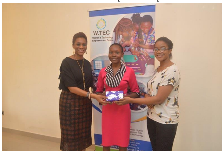
A Mentee receives an award presented by our Executive Director