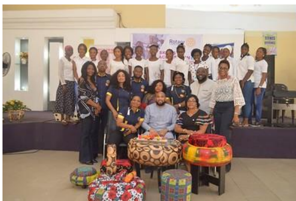
Cross Section of participants and partners