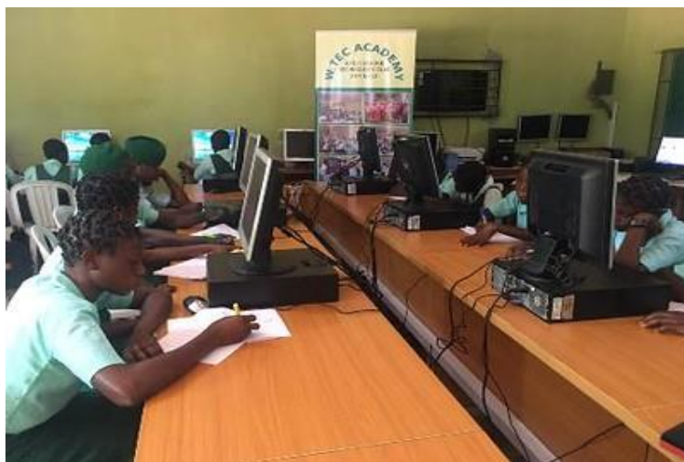
Cross section of Academy participants above and below

The Kwara Academy, which had commenced in January 2018, was expanded to 4 new secondary schools namely Anglican Comprehensive College – Offa, Offa Grammar School – Offa, St. Clare’s Anglican Girls’ Grammar School – Offa and Federal Poly International Secondary School - Offa. The curriculum comprised of: Computing Fundamentals, Basics of Word Processing, Graphic Design, Coding using Scratch and Mobile Phone Repair. There were 408 girls reached through this program in Kwara through this program.