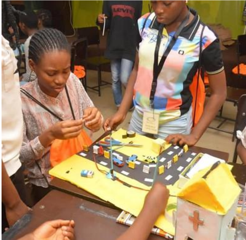
Participants building a street light