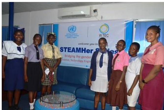
Cross Section of participants at the STEAMHer Series Program

A second session was held on staying safe online at the UNIC with Mr. Seyitayo Samuel of USIS Lagos with about 100 girls in attendance. Nsini Udonta of ProjectAlert Vaw presented the basics of sexual abuse and the proper rules of engagement for girls with adults and the opposite sex.