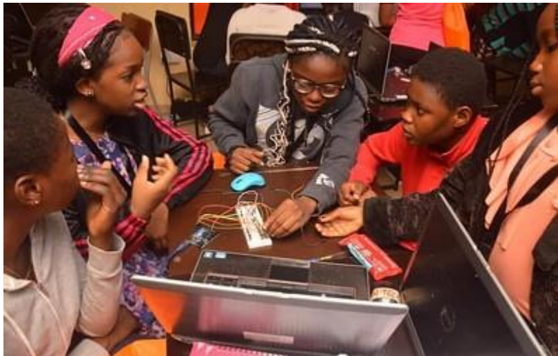
Participants in Mechatronics class